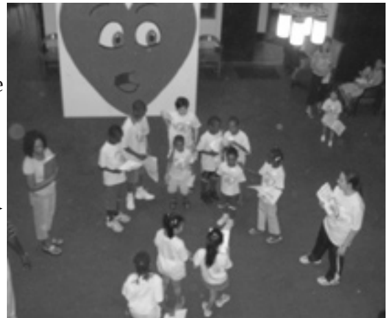
→ The heart is surprised by how well we can sing.