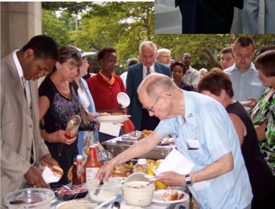
So many good choices!